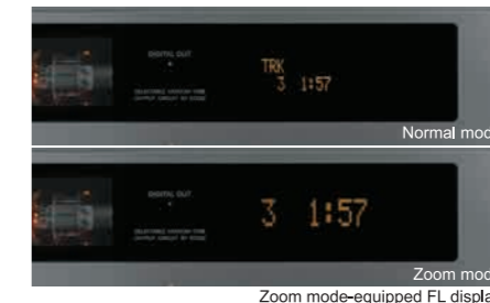
Zoom mode-equipped FL display

The D-380 features a large, high quality, high visibility FL display with 4x zoom mode – a useful tool for remote operation from a listening position at distance from the system. The orange colour of the display takes into consideration the illumination environment of a listening room, whilst a dimmer (illumination switching) function can turn the display light off completely.