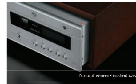
Natural veneer-finished case

The elegant exterior of the D-380 is housed in a full sized wooden box (440mm in width) with a natural veneer finish and a stylish hairlined surface on the front panel. When used together with the similarly housed LUXMAN amplifiers such as the LX-380 vacuum tube integrated amplifier, the effect is pleasing.