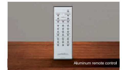
Aluminum remote control

A stylish aluminium remote control is supplied with the D-380 enabling comfortable operation of the system from any listening position. The remote control allows the user to perform necessary functions such as the choice of various playback options. The articulator mode is also available by holding down the CLEAR button to refresh the sound quality by demagnetizing the output transformer of the vacuum tube circuit.