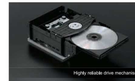
Highly reliable drive mechanism

The D-380 features a left sided mechanism layout to accommodate the ideal flow for the sound signal and power supply as proven in the D series of SACD players. A new mechanical design has resulted in an 8mm thick solid aluminium base with a loopless and shielded box chassis to provide support for the drive mechanism and stability in reading the digital signal.