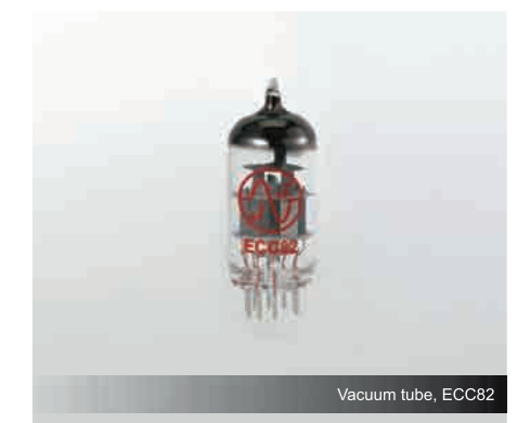
Vacuum tube, ECC82

The D-380 has been designed to be durable with sufficient margin built in for the operating voltage and the heat radiation of the vacuum tube.